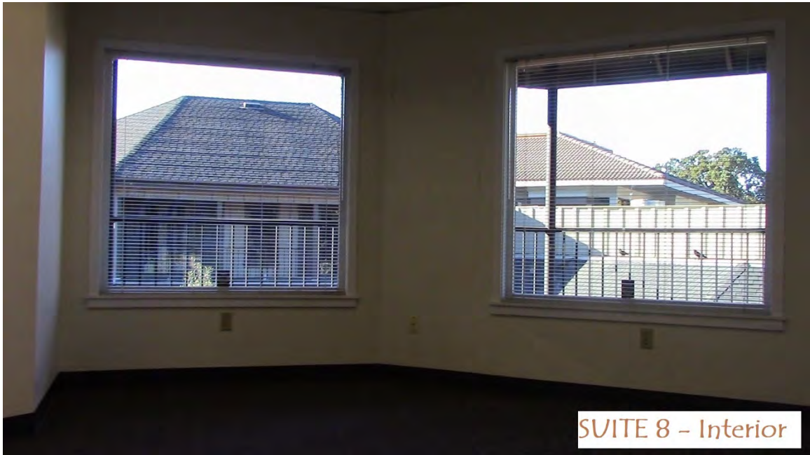
SVITE 8 - Interior