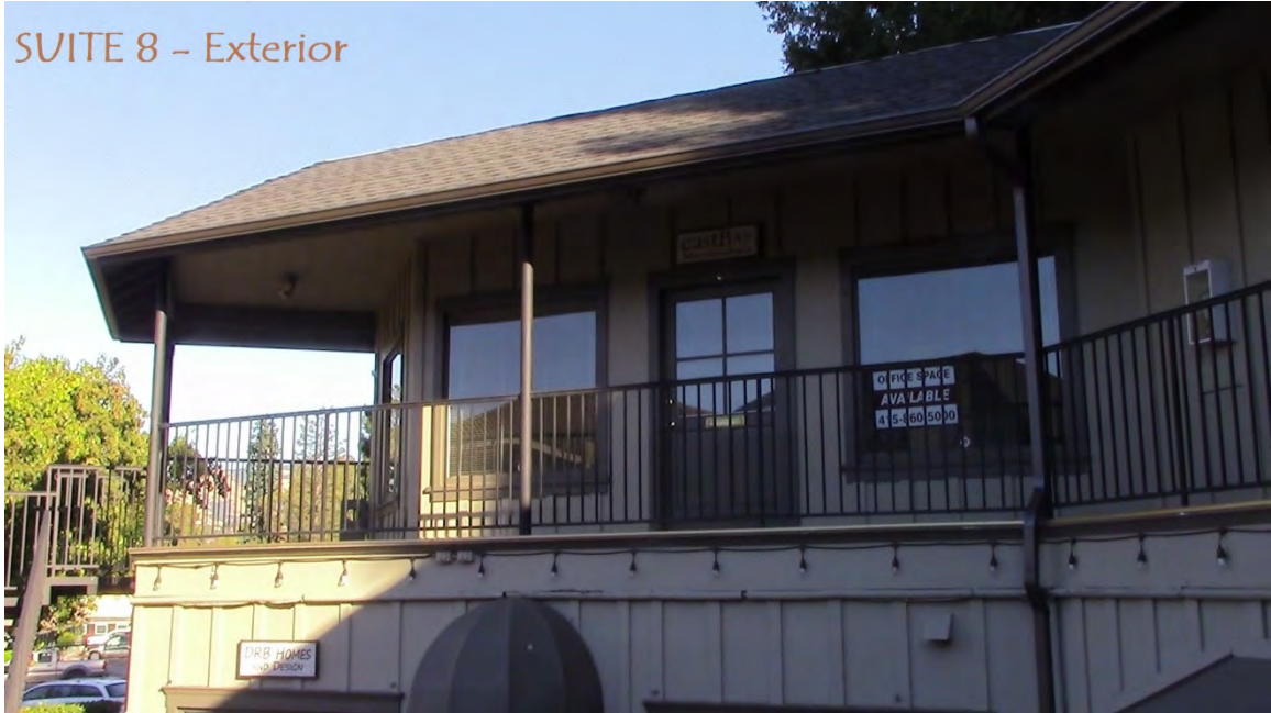
SVITE 8 - Exterior