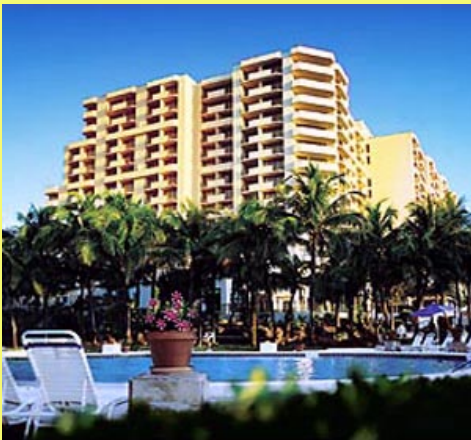
Marriott Harbor Beach Resort and Spa on Ft. Lauderdale Beach South (Est. $300s/night).

6. Hotels on or near the beach have been identified that will block rooms for our MHS65 Reunion group.