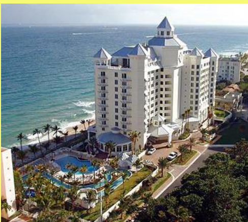
Pelican Grand Beach Resort on Ft. Lauderdale Beach North (Est. $300/night).