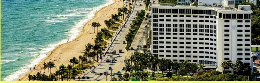
Sonesta Hotel on Rt. A1A opposite Ft. Lauderdale Beach (Est. $200s/night).