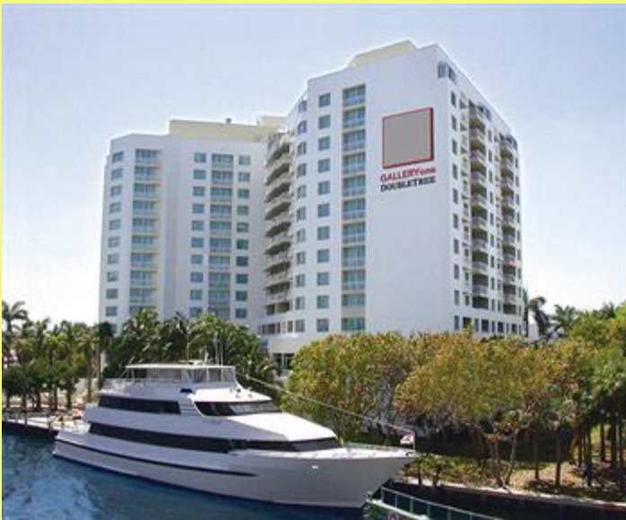
Gallery One Doubletree on Intracoastal Waterway North Ft. Lauderdale (Est. $180/night).